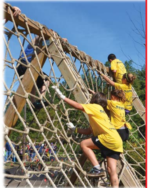
Among the race's obstacles were an A-frame rope wall, a stack of logs, and a mud pit.