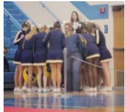
Mr. Hickey shared two emails, including one that included this photo of the girls praying together before a competition.