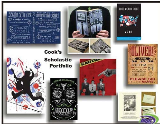
Sydney Cook - Art Portfolio