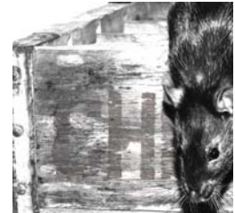
Hunter Hawkins Activity Digital Photo Superintendent's Award