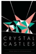
Tricia Kimmel Crystal Castles Digital Graphic Juror Award