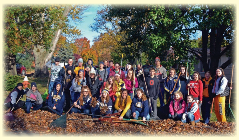
Students in DECA and the National Technical Honor Society volunteered at Yard Fest.

ELEMENTARY CROSS COUNTRY EVENTS — Our younger students have also been running at Pumpkin Runs, Elementary Cross Country Meets, and the 6th Grade Cross Country Meet. Thanks to our physical education teachers for your time and work on these events.